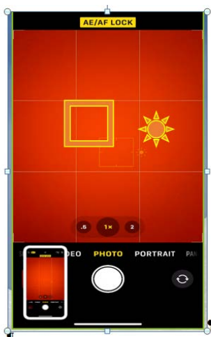
Image of what your phone camera screen looks like with the AE/FE Lock turned on.

Use the “Focus Finger.” Doing so will ensure that the phone focuses where you want it to focus. Apple and most cell phones do a good job finding the right focus, but it is also possible your phone will focus on the vase rather than the arrangement or not focus on the depth of your arrangement. You can take control: (1) Place your finger on the area in your camera you deem the best. A yellow box with a yellow “sun” will appear. (2) Keep your finger on the spot until you see the AE/AF caption on the top of the image. (3) Slide your finger up and down on the sun to increase or decrease exposure if you need to. When you have the AE/AF lock on, exposure and focus will remain on what you put it on, even if you move the camera around slightly.